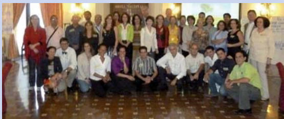
ICT Forum, Havana, March 2011

PRO-IDEAL PLUS ( www.pro-ideal.eu ) is a FP7-ICT support action, fostering ICT dialogues and R&D collaboration between Europe and Latin America in the field of ICT, including research topics addressed by NEM SRA, such as future networks, networked media and search systems, intelligent information management and content creation.