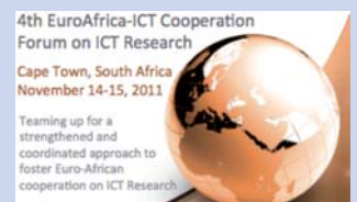
Laura de Nalle Sigma-Orionis

More information is available at http://euroafrica-ict.org/events/cooperation-forums/2011-cooperation-forum/